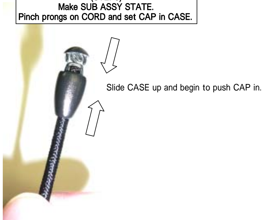
<pic-C> SUB ASSY STATE

(STEP3) Make SUB ASSY STATE. Pinch prongs on CORD and set CAP in CASE.