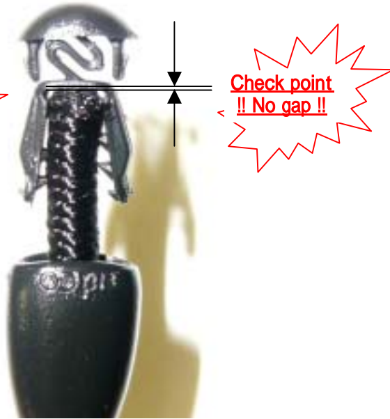
<pic-A> part structure